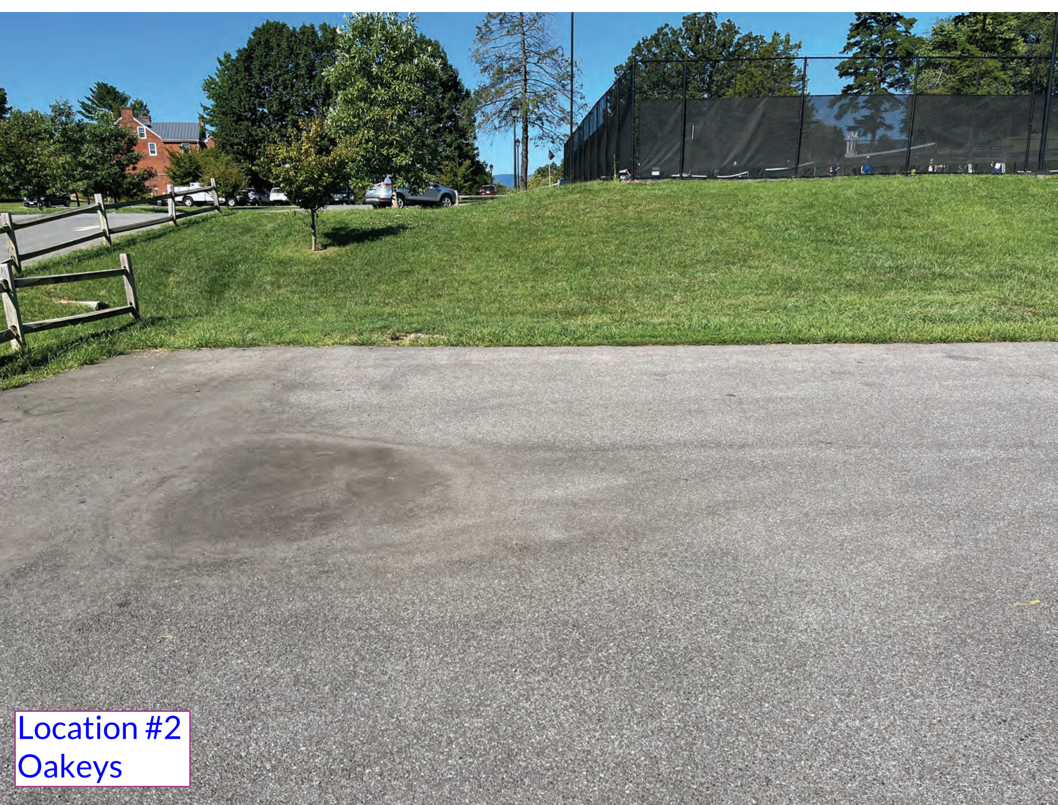
Location #2 Oakeys