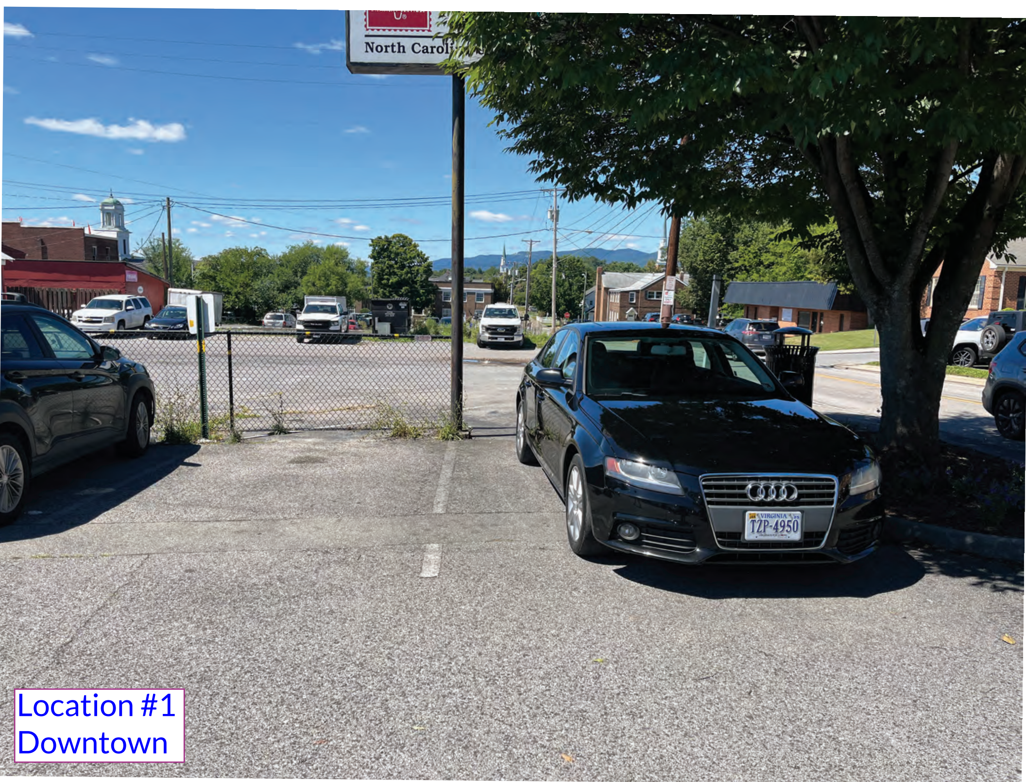
Location #1 Downtown