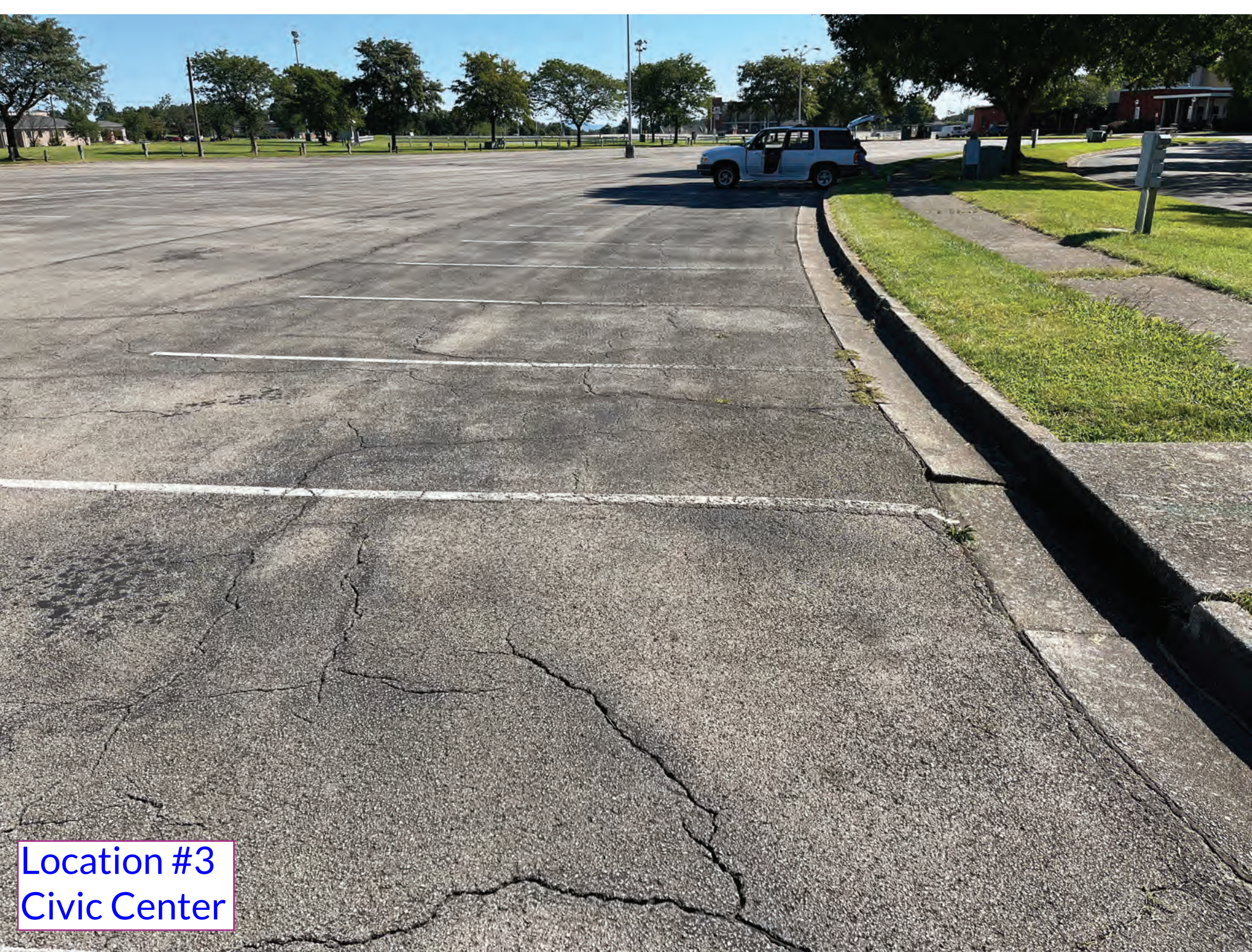
Location #3 Civic Center