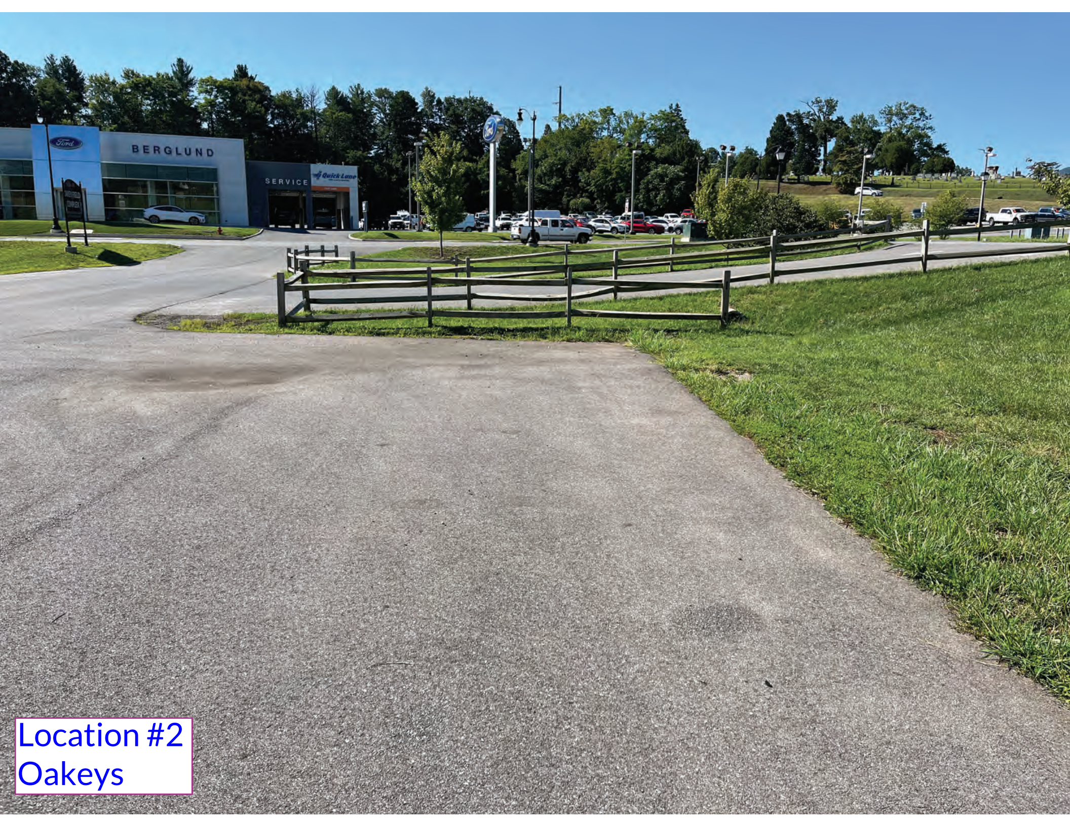
Location #2 Oakeys