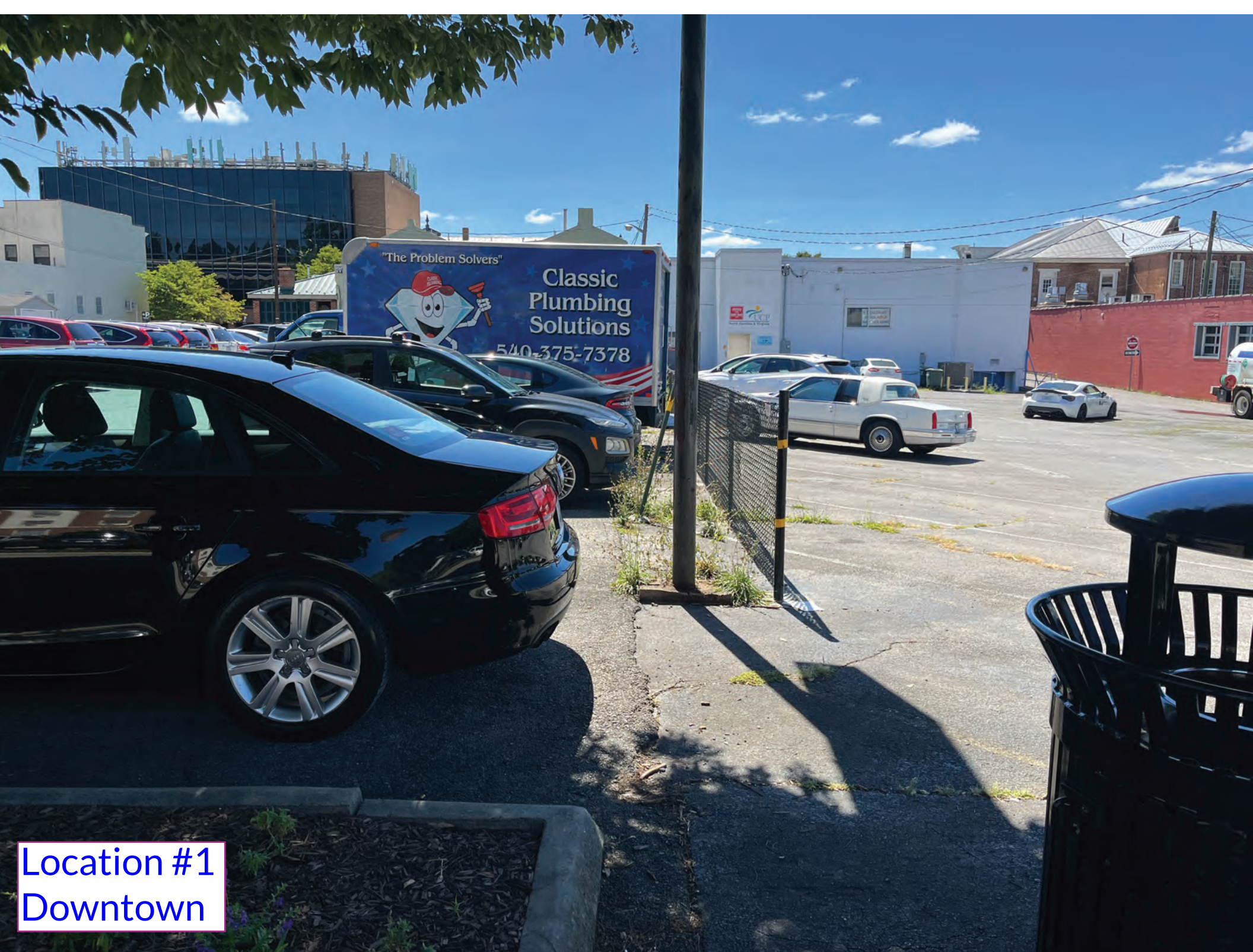
Location #1 Downtown