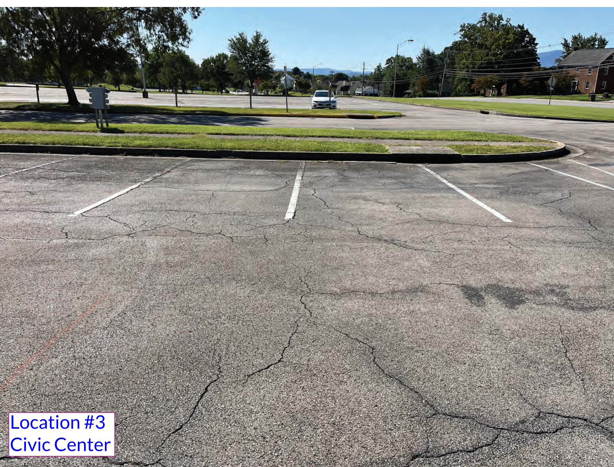
Location #3 Civic Center