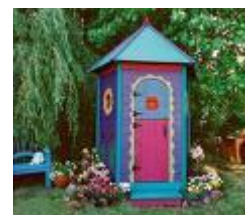
Permit not required

Zoning permits are required regardless of structure size. Contact the Zoning Administrator at (540) 375-3032 for setback and easement requirements. No buildings shall be placed in a flood plain.